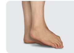
Plantar flexed foot/ankle